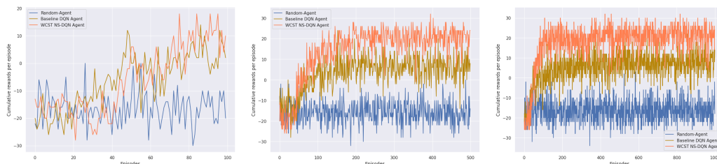
Figure 3: The performance of the three agents over 100, 500 & 1000 episodes in the non-stationary environment

These results highlight the NS-DQN agent’s superior ability to navigate the complex, non-stationary landscape of the WCST environment. Its performance accentuates the importance of architectural considerations in the development of RL agents for dynamic problem spaces.